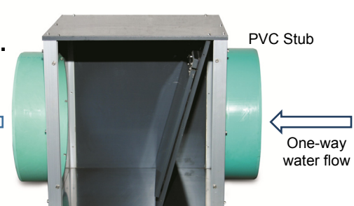
Check Valve showing working parts and water flow direction.