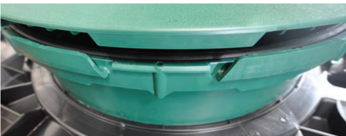
Set lid on uppermost riser segment and rotate to receiving pocket on riser.

The EZsnap Lid will accommodate both the narrow and the wide end of the riser. To install, set the lid on top of the uppermost riser segment and rotate until the riser tabs recess into the receiving pockets on the lid. The lid will drop downward approximately 1/2" (13 mm) and stop rotating when seated properly. With the lid properly seated, the screw pilot holes are in alignment.