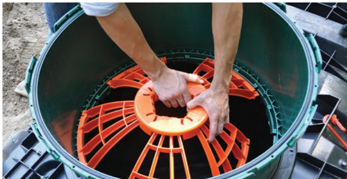
Infiltrator's five arm Safety Star system is equipped with a folding arm for easy installation.