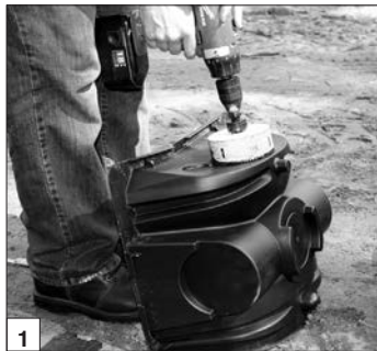
1 Drill end cap.