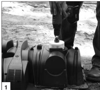
1 Drill Quick4 Plus Periscope.