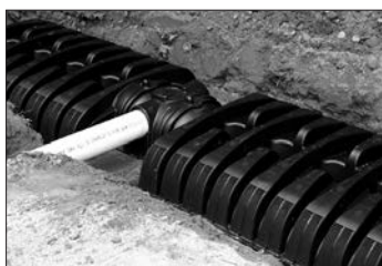
All-in-One 8 as mid-line connection.

6. Repeat Steps 1 through 5 for additional trenches.