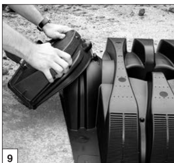
Place end cap outlet end.

9. The last chamber in the trench requires an end cap. Lift the end cap at a 45-degree angle and align the connector hook on the top of the chamber with the raised slot on the top of the end cap. Lower the end cap to the ground and into place.