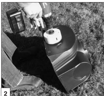
Drill endcap on end.

2. With a hole saw, drill an opening on the end of the Quick4 Plus All-in-One 8 Endcap to create an invert at 0.5 inches. This will allow effluent to fill both sides of the chamber line.