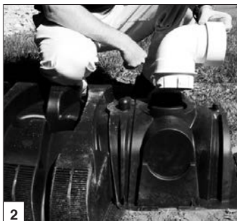
2 Insert Quick4 Plus Periscope.