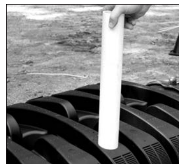
Chamber inspection port.

2. Set a cut piece of pipe of the appropriate length into the corresponding chamber's inspection port hole.