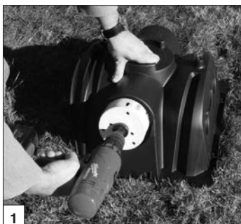
Drill endcap on side or top.

1. With a hole saw drill the opening appropriate for the pipe diameter being used on the side (3.3" invert) or on top (9.0" invert) of the Quick4 Plus All-in-One 8 Endcap.