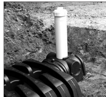
All-in-One 8 inspection port.

1. With a hole saw drill the pre-marked area in the top of the Quick4 Plus All-in-One 8 Endcap to create a 4 1/3 to 4 1/2-inch opening based on type of pipe.