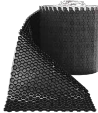
EZ Roll™ Grass Pavers