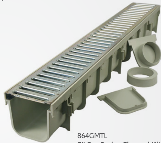
864GMTL 5" Pro Series Channel Kit

All parts for a complete installation included