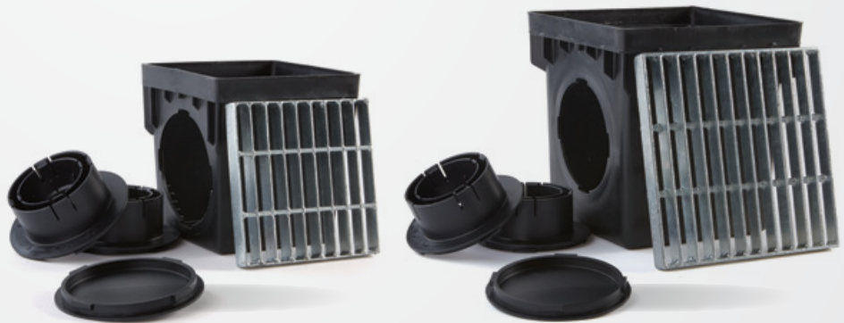
900MTLKIT 9" Catch Basin Kit