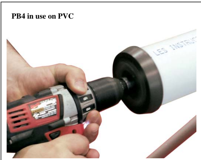
PB4 in use on PVC

DRAINAGE SOLUTIONS, INC www.drainagesolutionsinc.com