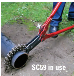
SC59 in use

With a captured screw, the SC49 is the easiest to use for close quarters work. SC59 single stroke cutter is the fastest when no space restrictions exist. REED's cutters have stronger jaws, chains and adjusting screws.