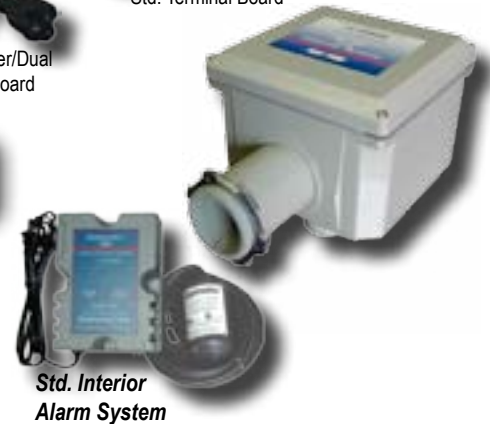
Std. Interior Alarm System