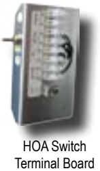
HOA Switch Terminal Board