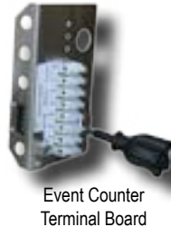
Event Counter Terminal Board