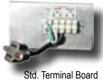
Std. Terminal Board