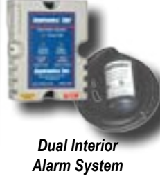
Dual Interior Alarm System