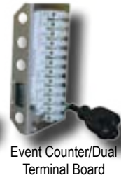
Event Counter/Dual Terminal Board