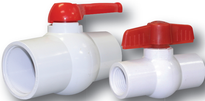
2-1/2" - 4"