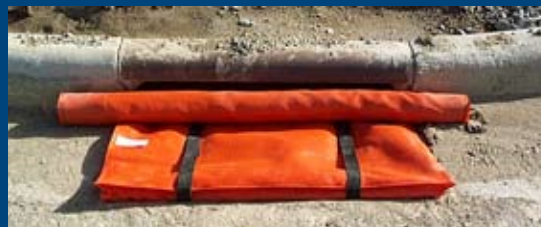
DANDY CURB BAG® For grated curb and gutter inlets