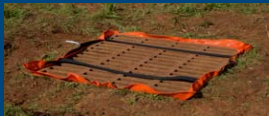
DANDY SACK® For under the grate containment