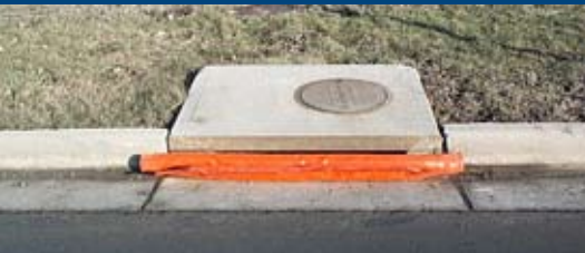
DANDY CURB® For inlets without grates.