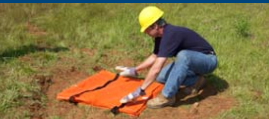
DANDY BAG® For flat grates and mountable curbs