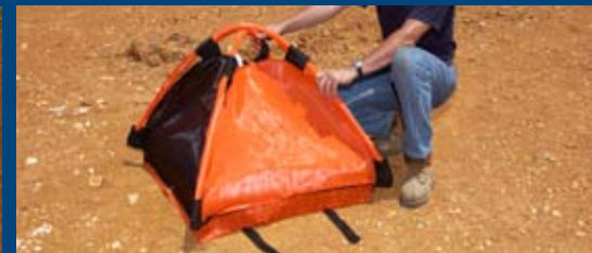
DANDY POP® For flat field grates