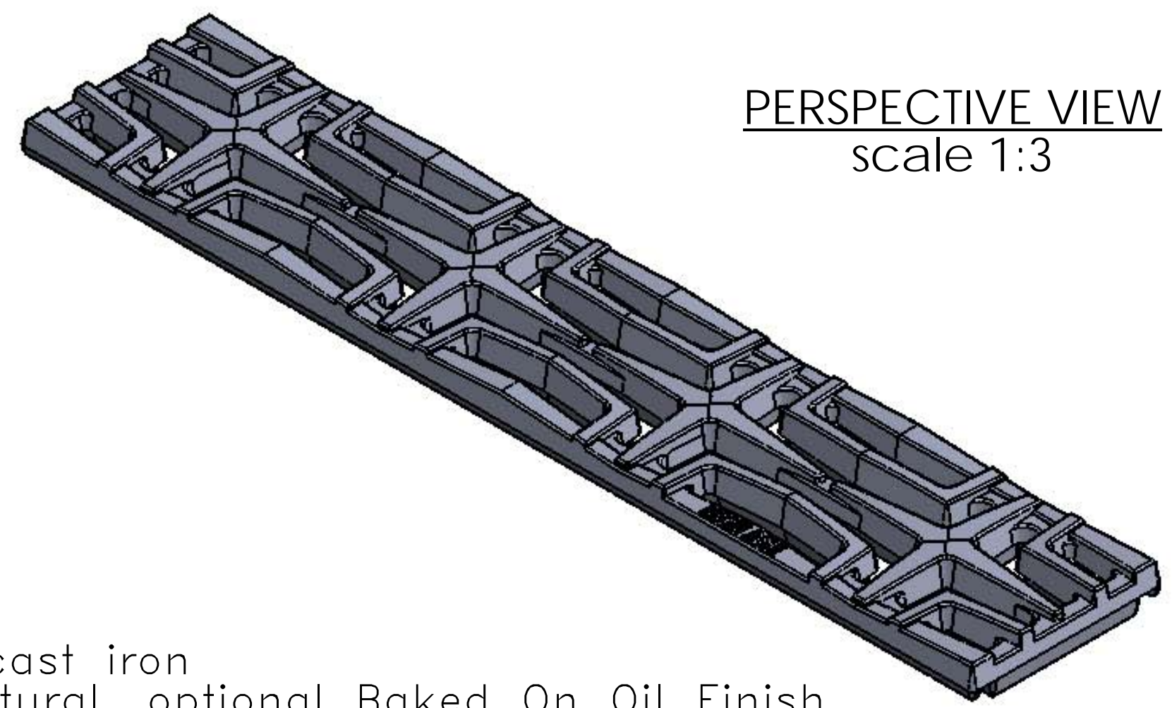
PERSPECTIVE VIEW scale 1:3