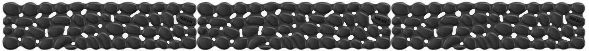
3 GRATES ARRAYED SCALE 1 : 6