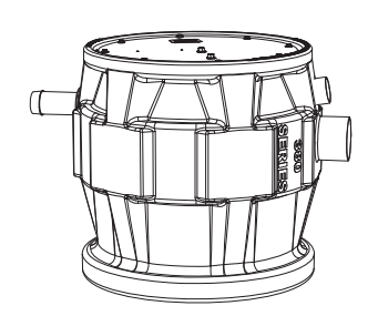
Pro380-SD-Series Sewage System