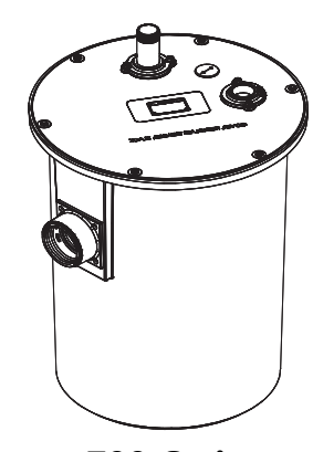
700-Series Sewage System