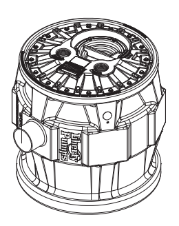
Pro380-Series Sewage System