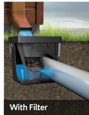
Clear, unclogged pipe