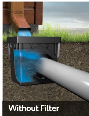
Pipe clogged with debris

Adding a filter is a simple solution to keep water flowing through a drainage system and a cost-effective alternative to expensive repair or replacement.