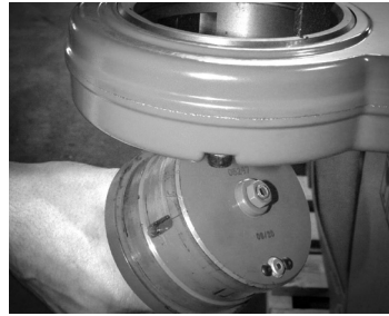
Both the TMPDA and VOKUCLUTCH install in the same orientation.