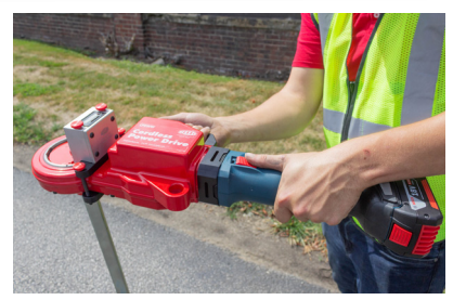
For Valve Exercising - requires VOKUCLUTCH