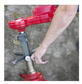
For Tapping/Drilling - requires TMPDA