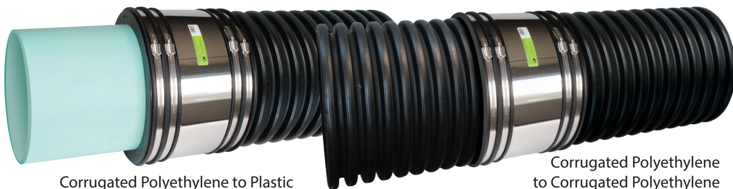
Corrugated Polyethylene to Plastic

Ultimate Sealing Gasket - The flexible PVC gasket has a smooth inside surface providing greater sealing performance than ribbed rubber gaskets. The smooth internal wall of the gasket makes contact 360° over its entire length. This equates to a larger sealing surface and a higher coefficient of friction, providing maximum sealing capabilities as well as preventing slippage under the weight of shear forces.