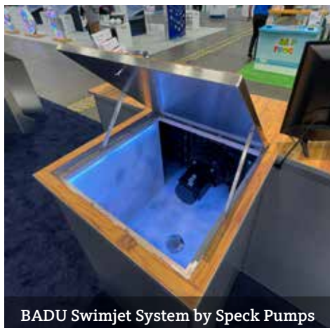
BADU Swimjet System by Speck Pumps

Good design is obvious. Great design is invisible!