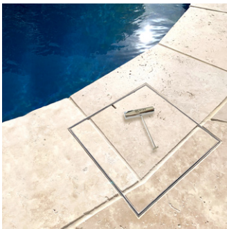
SKIMMER BOX COVERS