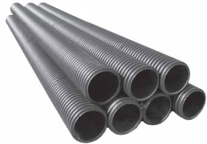
| 12" x 20' SF Solid |