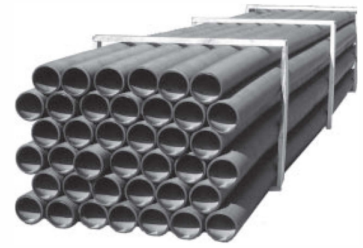
| 6" x 20' SF Solid |

Smooth Flow pipe is a corrugated polyethylene pipe with a smooth interior. This combination provides a light weight, durable product for storm sewers, culverts, and many other applications where high strength and maximum flow are essential. Haviland Smooth Flow pipe is available with plain ends from 8" to 30" and with belled ends from 4" to 60". Smooth Flow pipe conforms to AASHTO M-252 and AASHTO M-294 specifications. An installation guide is available specifically for Smooth Flow pipe on our website. As shown below, 4" and 6" pipe can be ordered in pallets.