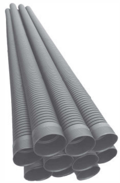
| 8" x 20' SF Solid w/Bell |