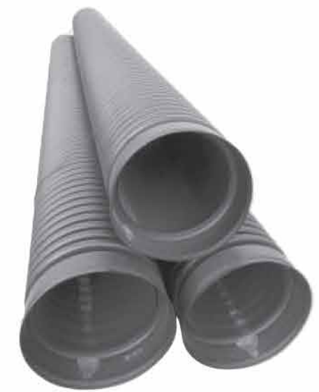
| 18" x 20' SF Solid w/Bell & Spigot |