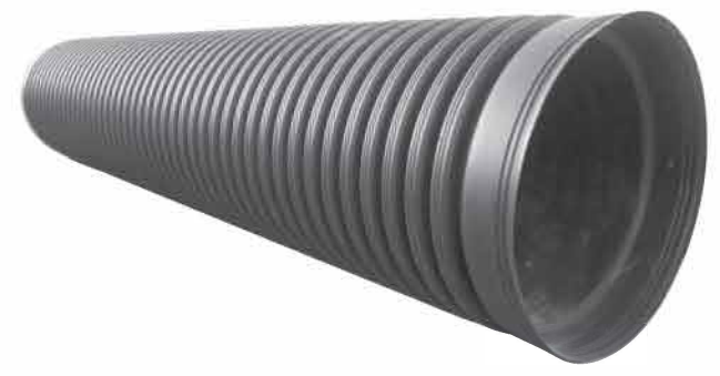
| 48" x 20' SF Solid w/Bell & Spigot |