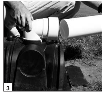
Connect inlet pipe.