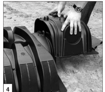
Place end cap inlet end.

Optional: Fasten the end cap to the chamber with a screw at the top of the end cap.