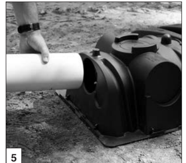
Insert inlet pipe.