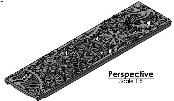
Perspective Scale 1:5