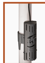
Compact Snap-on Float Switch Fits 1-1/4" or 1-1/2" pipe (Sump application)