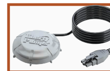
Puddle Sensor (For floor level sensing)