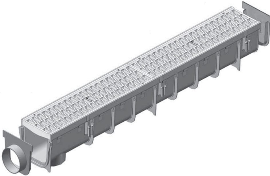
NDS #864 Polypropylene