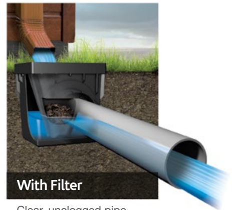
Clear, unclogged pipe