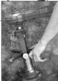
CPDWW on TM1100

To learn more about adding power to drilling and tapping jobs, visit www.reedmfco.com .