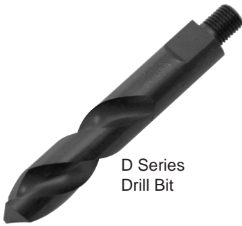
D Series Drill Bit

After purchasing any one of the Drilling Machines, the customer must purchase the appropriate drill bit, hole cutter, or shell cutter.