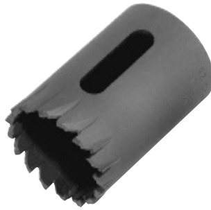
Heavy Duty Carbide-Tipped Hole Cutter