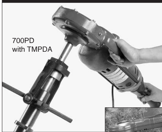
700PD with TMPDA

To learn more about adding power to drilling and tapping jobs, visit www.reedmfco.com .