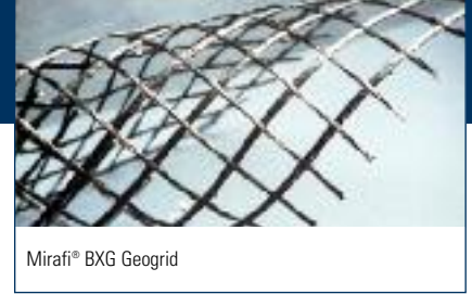
Mirafi® BXG Geogrid

Prepare the ground by removing stumps, boulders, etc. and fill in low spots. Unroll the Mirafi® BXG geogrids directly over the ground to be stabilized. If more than one roll width is required, overlap rolls. Place the aggregate onto previously installed geogrid.