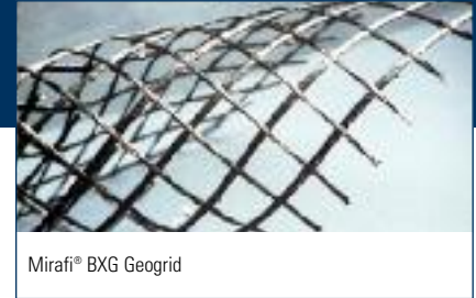
Mirafi® BXG Geogrid

Prepare the ground by removing stumps, boulders, etc. and fill in low spots. Unroll the Mirafi® BXG geogrids directly over the ground to be stabilized. If more than one roll width is required, overlap rolls. Place the aggregate onto previously installed geogrid.