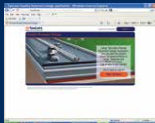
MiraSpec Design Solutions Software is easy to use and is available at no cost at www.Mirafi.com

Geosynthetics began the extensive research and design process of looking for the "perfect" geotextile that could move more water while concurrently retaining more soil within a roadway system. This product would also need to hold more force with less overall system movement in order to improve the base strength and support heavier loads; thus, resulting in longer life, less maintenance and costs, and better performance.