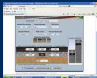
MiraSpec Design Solutions Software provides cost savings and "green" savings by incorporating a geosynthetic.

As the leader in geosynthetic solutions, TenCate