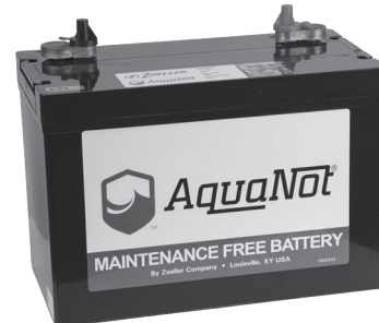
AquaNot® Deep-cycle Battery (purchase separately) P/N 10-1450 - AGM (shown) P/N 10-0761 - Wet