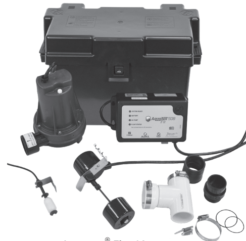
AquaNot® Fit 508 system